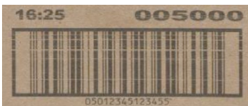
Printer cleaner off