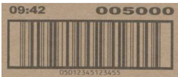
Printer cleaner on